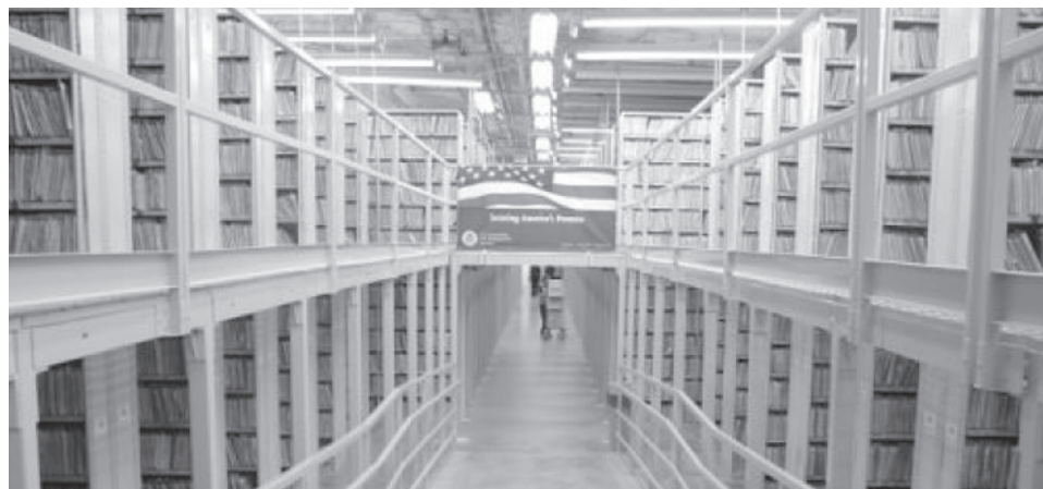
Figure 2: A-Files Storage at National Records Center in Lee's Summit, Missouri